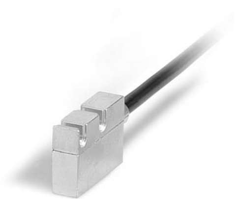
SML • SMH