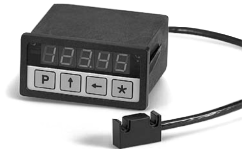
LD120 + SM5